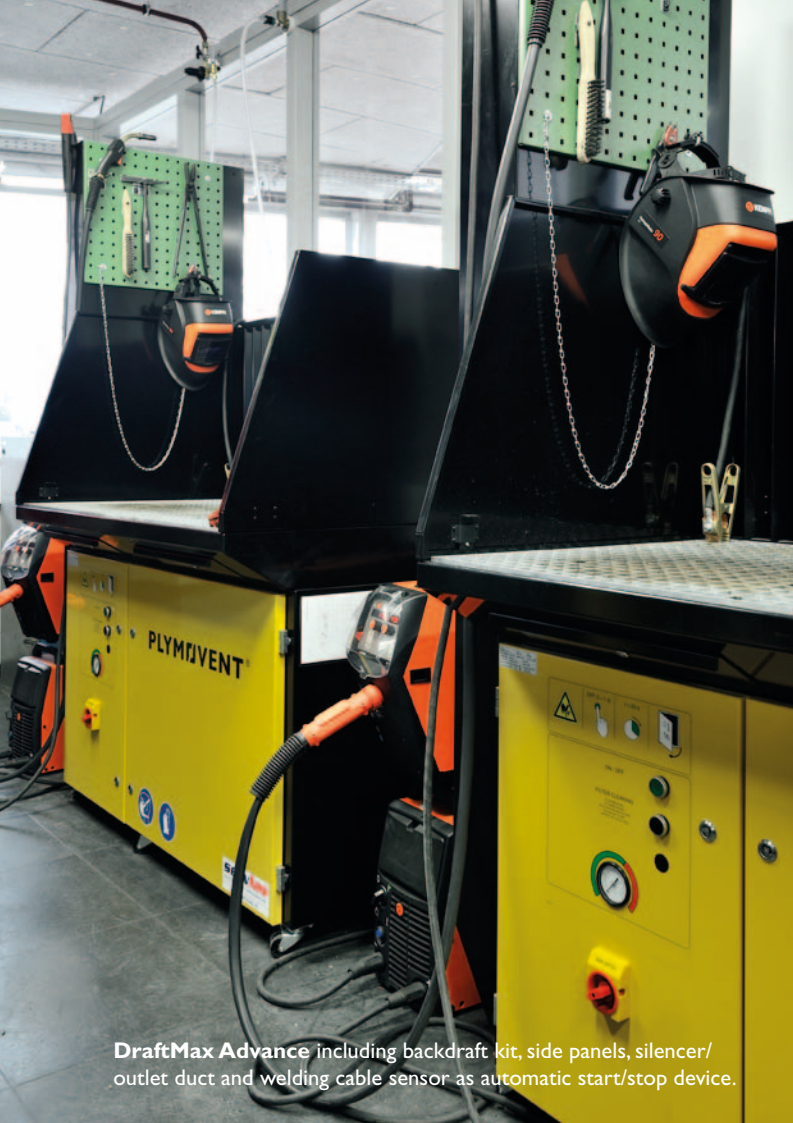
DraftMax Advance including backdraft kit, side panels, silencer/ outlet duct and welding cable sensor as automatic start/stop device.