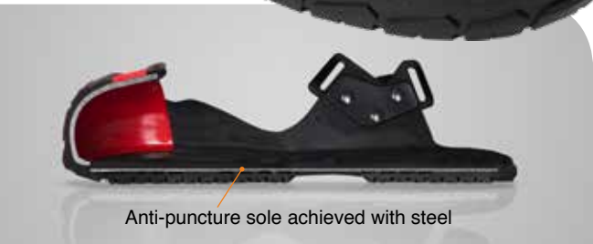
Anti-puncture sole achieved with steel