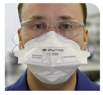
3M™ VFlex™ Particulate Respirator 9152S (Small size)