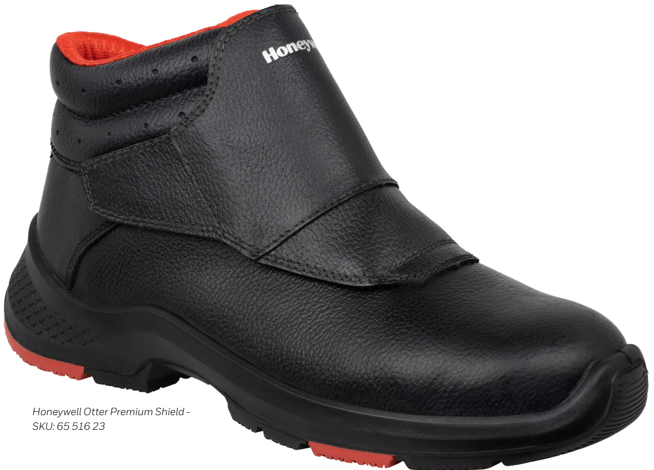
Honeywell Otter Premium Shield - SKU: 65 516 23

Honeywell Otter Premium Footwear meets the requirements of EN ISO 20345:2011 and EN ISO 20349-2:2017 2 and will be certified soon to DGUV 112-191. Choose safety boots or shoes with complete confidence that you will be providing your workers with the best available protection.