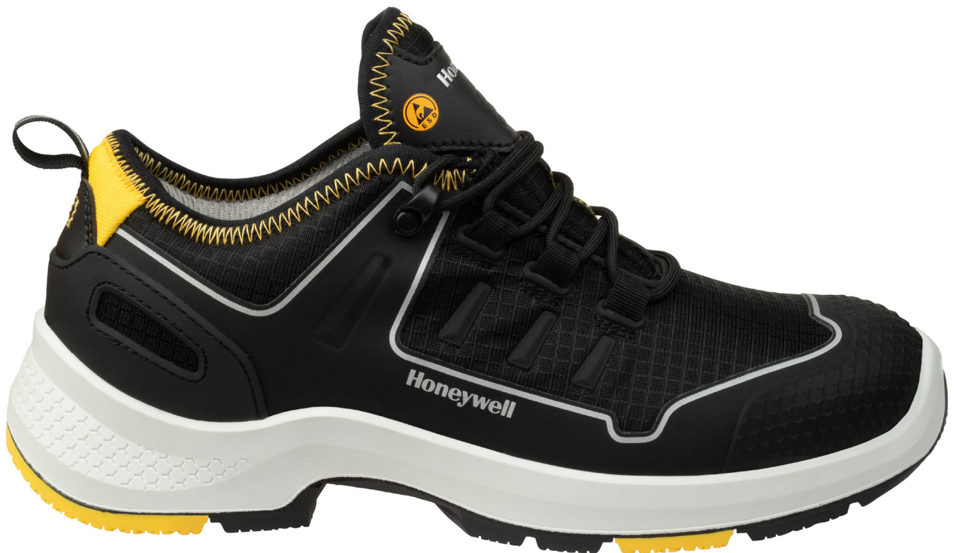
Honeywell Otter Premium Protect - SKU: 65 516 18

Honeywell Otter Premium footwear provides premium protection, stability and comfort. Benefit from their excellent slip and cut protection, high shock absorption, antistatic properties plus high- and low-temperature resistance and be fully aware when your shoes wear off with their unique indicators. Made of quality leather, with a premium textile lining and a modern design, Honeywell Otter Premium footwear is a perfect fit for everyone, providing comfort for long time use.