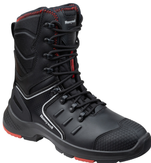
Honeywell Otter Premium Guard Ice - SKU: 65 516 22

Created to suit your specific needs, Honeywell Otter Premium safety footwear comes up with two insole options of choice. Benefit from great comfort with the light, breathable standard insole, made from high-quality open-cell polyurethane (PU). Get to the next level of protection with the premium insole's additional hexagonal-shaped gel inserts, providing more shock absorption, slip resistance and comfort.